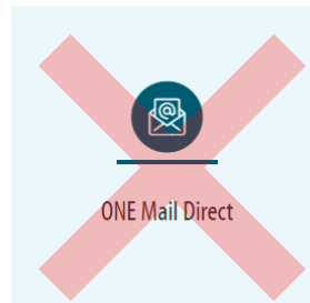
ONE Mail Direct

A ONE ID is made up of a login ID and password. It provides easy and secure access to provincial digital health services. Physicians must register for a ONE ID account .